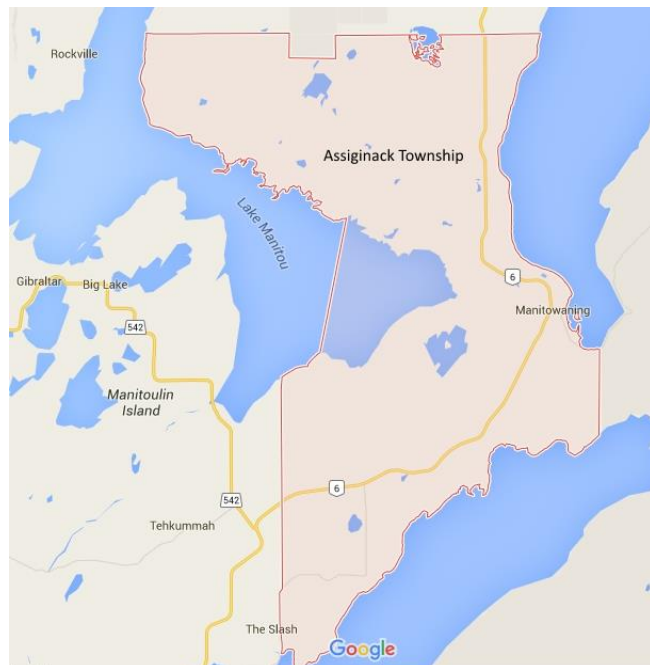
Figure 1: Assignack Township Boundary

Assignack Township is located on Manitoulin Island, in the province of Ontario.