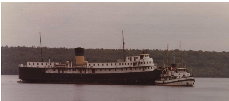
Norisle arrives in Manitowaning pulled by the tug Ivan Purvis.