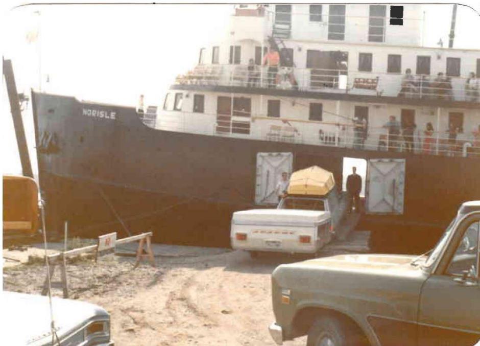
The Norisle was a side loader and cars would drive on or be driven on and parked on the upper car deck or taken down to the lower car deck by an elevator. This picture is c1973.