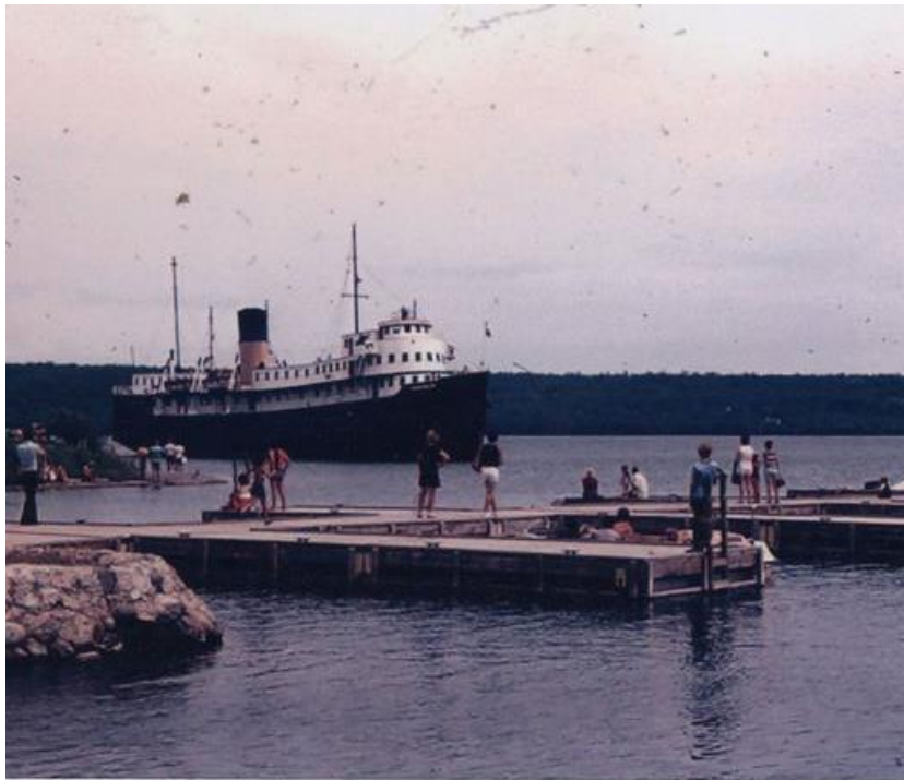
HERE COMES THE SS NORISLE