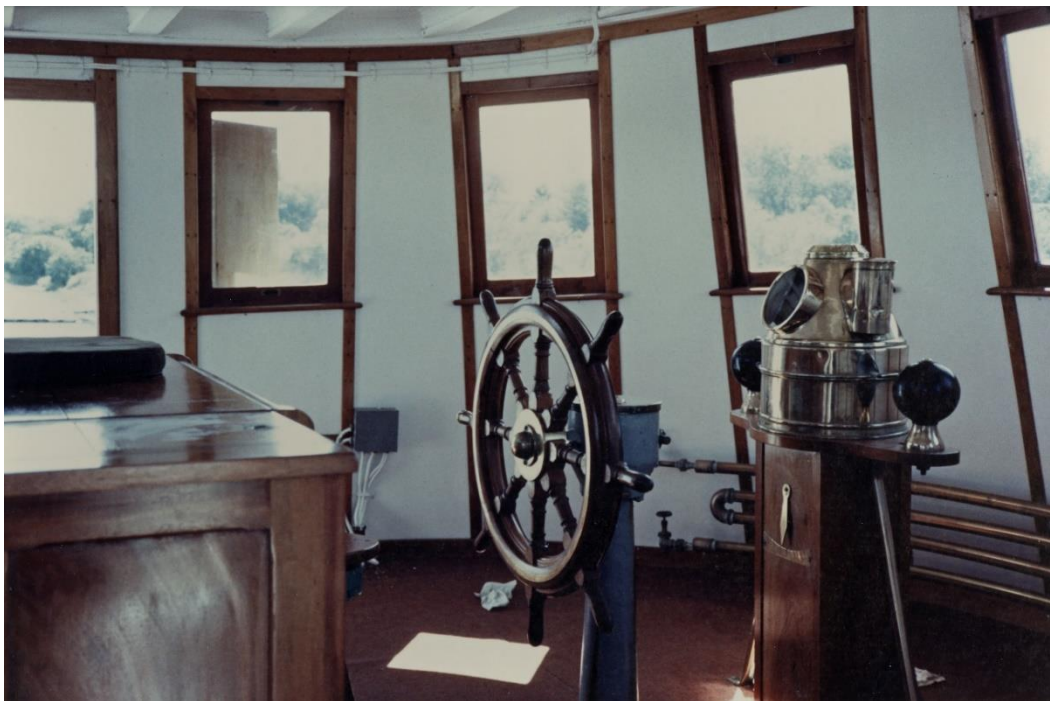
The Wheel House

With the acquisition of the Roller Mills and Wharf, it was decided that the Assiginack Historical Society, who were responsible for the Museum should take over this area as part of their mandate. This was definitely a major undertaking for a small community group. The area along with the Assiginack Museum, Lighthouse and St. Paul's Church became part of a historical tour. Steps were added on Wellington Street to help tie the area together for a walking tour. Picnic area, theatre, restaurant, etc. would add to this area's draw.