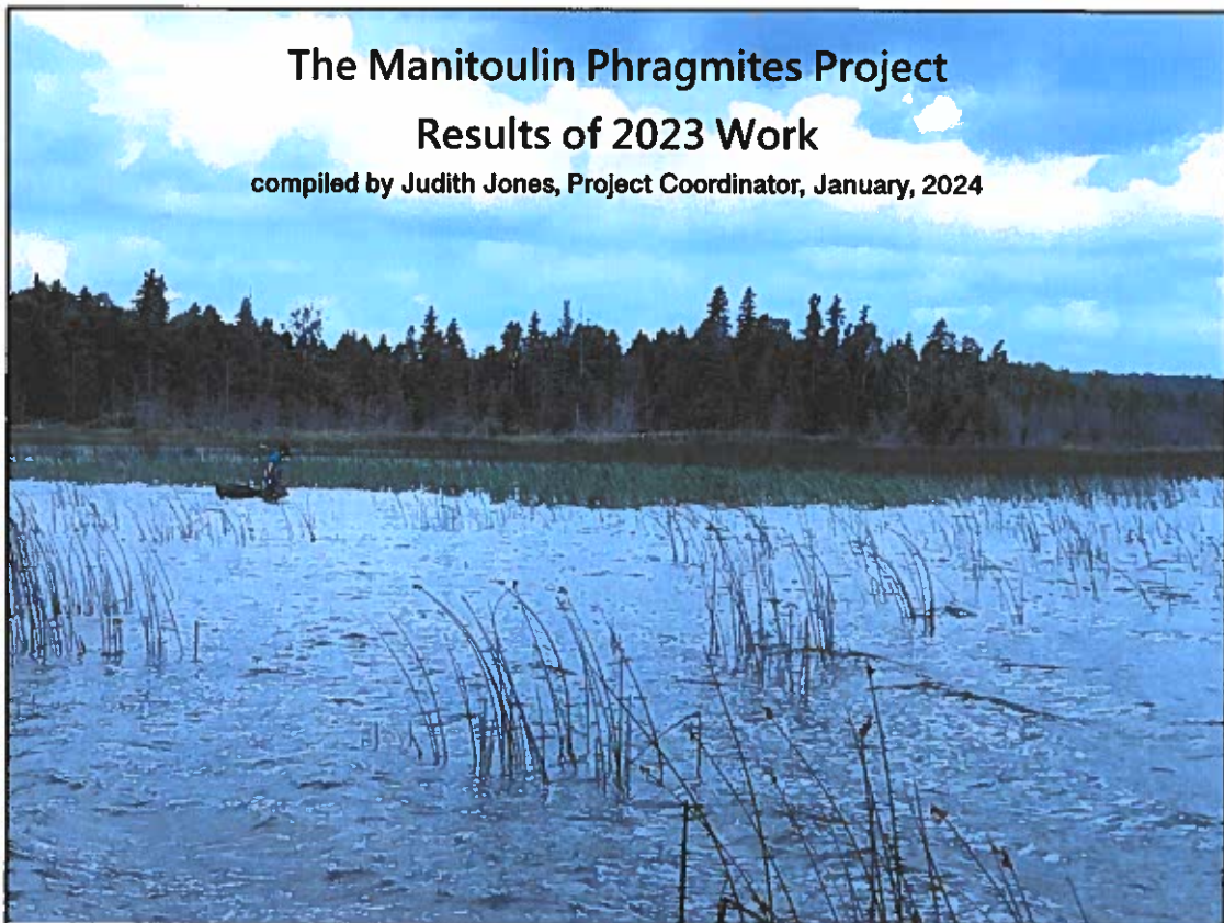
A volunteer doing the third summer of cutting to control Phragmites at Leask Bay/Hilly Grove.

Phragmites (say “frag-MITE-eeze”) is a very tall, invasive grass that has been spreading aggressively on shorelines and in wetlands in our area. Phragmites grows into dense patches that can eventually wipe out all other vegetation. It is a serious threat to wildlife and fish habitat, recreation, tourism, property values, and aesthetics. Southern Ontario has lost thousands of hectares of natural habitat to this highly invasive species. The Manitoulin Phragmites Project was started to make sure this does not happen on Manitoulin Island. The Project has just finished its 8th year of work.